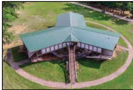
BROWN DOOR (capacity: 30): Two rooms sleep twelve and one room sleeps six, all bunk beds; six bathrooms and six showers. A/C