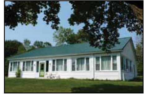
GREEN DOOR (capacity: 24): Two rooms with six bunk beds in each; four bathrooms and four showers. A/C