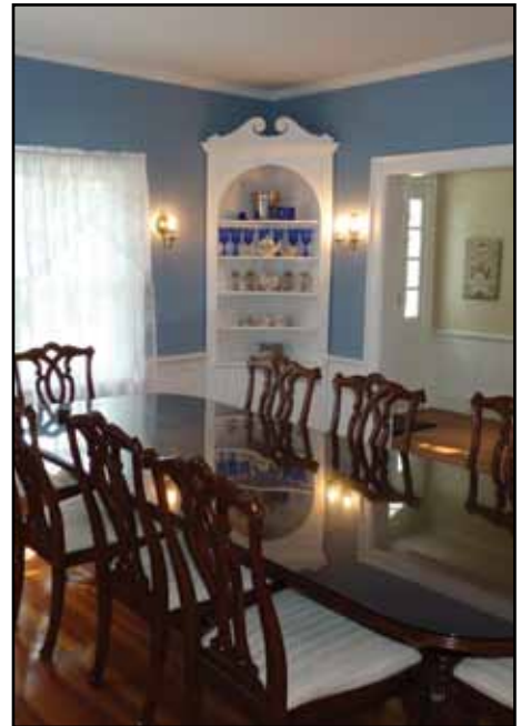
White House dining room

White House* Early American colonial house. Four bedrooms, three baths, wood burning fireplace and sun porch. Cap. 12 (1 queen, 8 singles, 1 daybed, 1 single hide-a-bed)