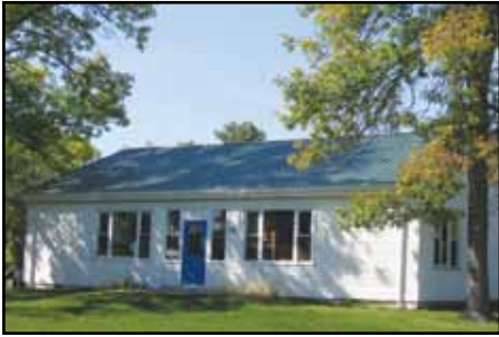
BLUE DOOR (capacity: 22): Two rooms with five bunk beds in each; three bathrooms and three showers. A third room sleeps two.

Bunk Cabins are seasonal and must be reserved for two nights minimum. They are near camping areas, have a dorm feel and are not on the lake. Guests bring their own sheets, blankets, pillows, towels and washcloths. Bunk Cabins are ideal for youth groups.