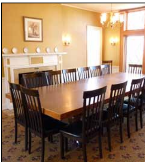
Christian Writing Center dining room

Charming two-story English-style stone house with four bedrooms, two and one-half baths and a sunken living room with Clavinova piano, gas fireplace and wonderful lake views. Cap. 12 (1 queen, 8 singles, 2 single sofa beds)