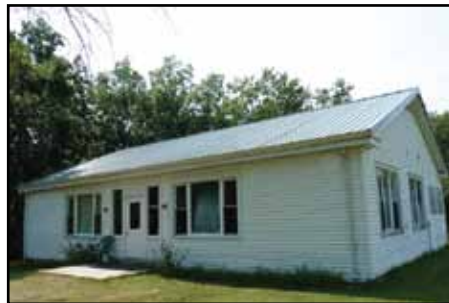
WARNER-KALLMAN (capacity: 23): Two rooms with five bunk beds in each; three bathrooms and three showers. A third room (with bathroom) sleeps three.