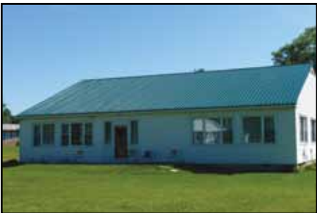
RED DOOR offers meeting space and is located near Blue Door, Green Door and Warner-Kallman. It includes a sink and counter. A/C